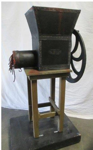
Inspiration for the grinder being created for this production

Requirements: Strong acting, singing and good movement.