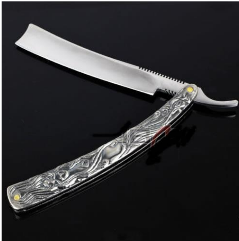
Image of the actual razors being used in this production (Note: no sharpened blades will be used on stage).

Requirements: Strong acting and singing.